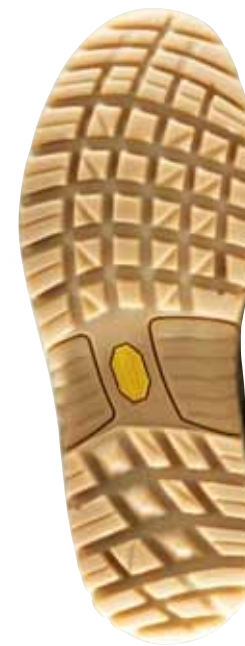
VIBRAM® VIALTA Sand option