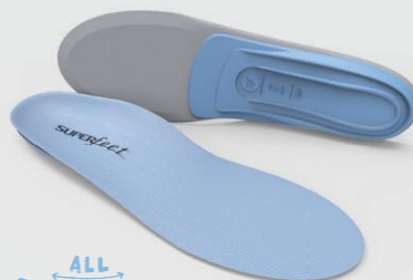
ALL PURPOSE SUPPORT MEDIUM ARCH