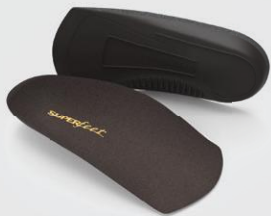
CASUAL EASYFIT® MEN'S Sizes: B-F | 860

Fits great in men's dress, casual, and everyday shoes with a heel height of 1 inch or less