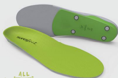
ALL PURPOSE SUPPORT HIGH ARCH