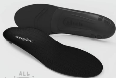
ALL PURPOSE SUPPORT LOW ARCH