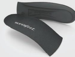
CASUAL EASYFIT® HIGH HEEL Sizes: B-E | 850

Fits great in women's dress, casual, and everyday shoes with a heel height of 1 inch or less