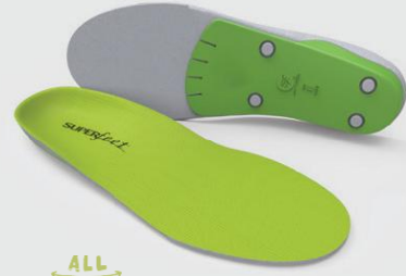
ALL PURPOSE WIDE-FIT SUPPORT