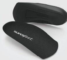
CASUAL EASYFIT® WOMEN'S Sizes: B-E | 870

Fits great in men's dress, casual, and everyday shoes with a heel height of 1 inch or less