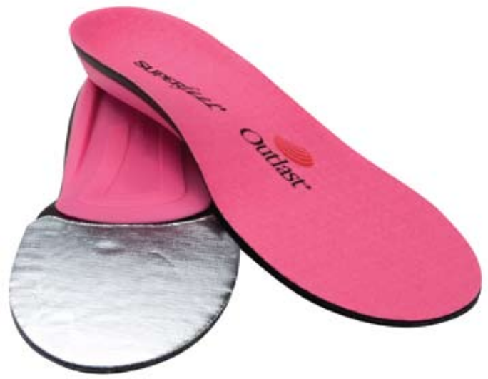
hotPINK FOR WOMEN

Superfeet's NEW REDhot and hotPINK Premium Insoles are engineered to protect your feet from the cold using our proprietary design technology. The patented shape addresses the unique differences between men's and women's feet and footwear.