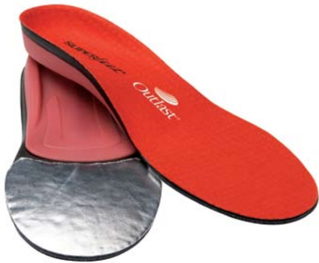
REDhot FOR MEN

Board with confidence. Ski the difference. Introducing new cold weather Superfeet Premium Insoles.