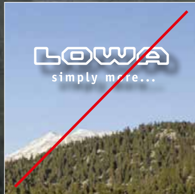
Avoid drop shadows