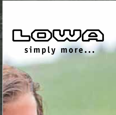
b/w usage on light backgrounds