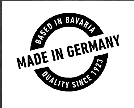
Rotation 13°, usage on light backgrounds