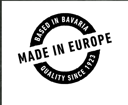
Rotation 13°, usage on light backgrounds