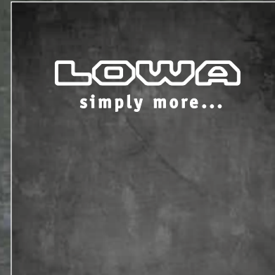
b/w usage on dark backgrounds