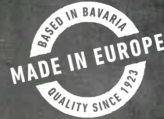
Rotation 13°, usage on dark backgrounds