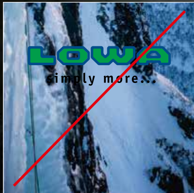
Avoid color versions on busy backgrounds