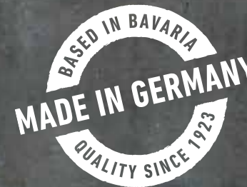
Rotation 13°, usage on dark backgrounds