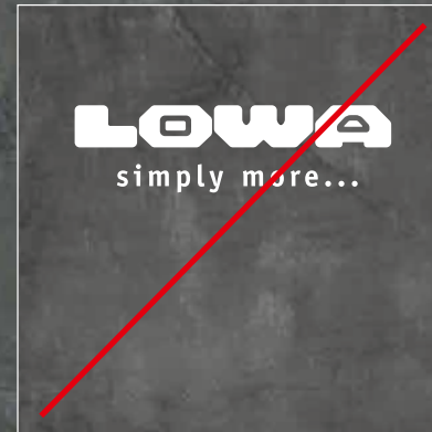
Avoid a solid color logo lettering in b/w usage