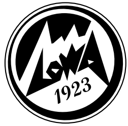
Retro Logo 1923 (Heritage applications)