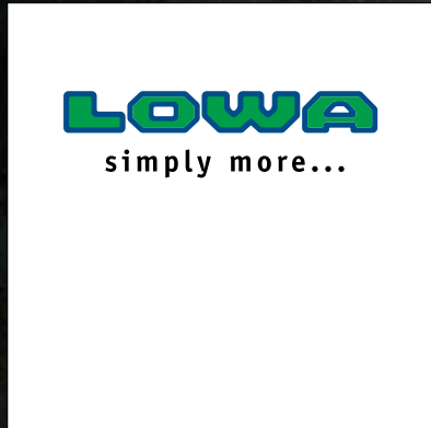
Standard Color Usage